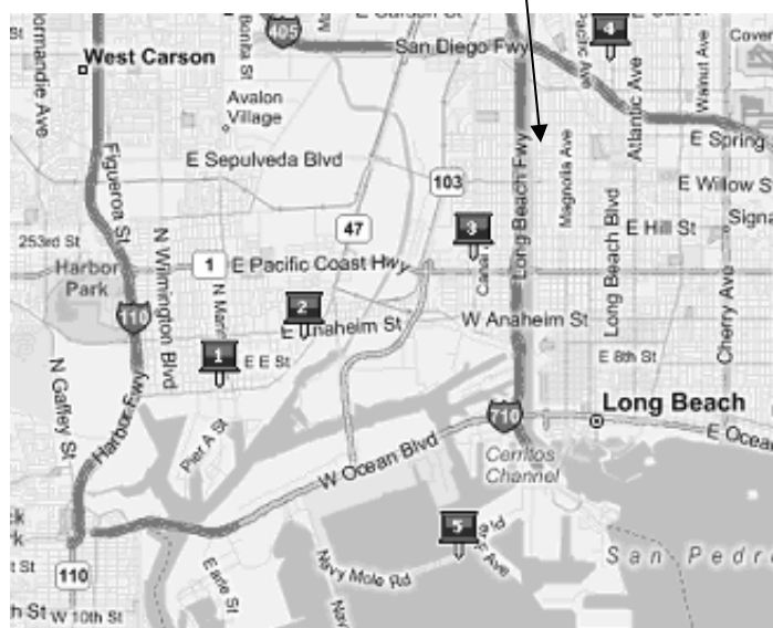
Figure S1 Sampling sites locations